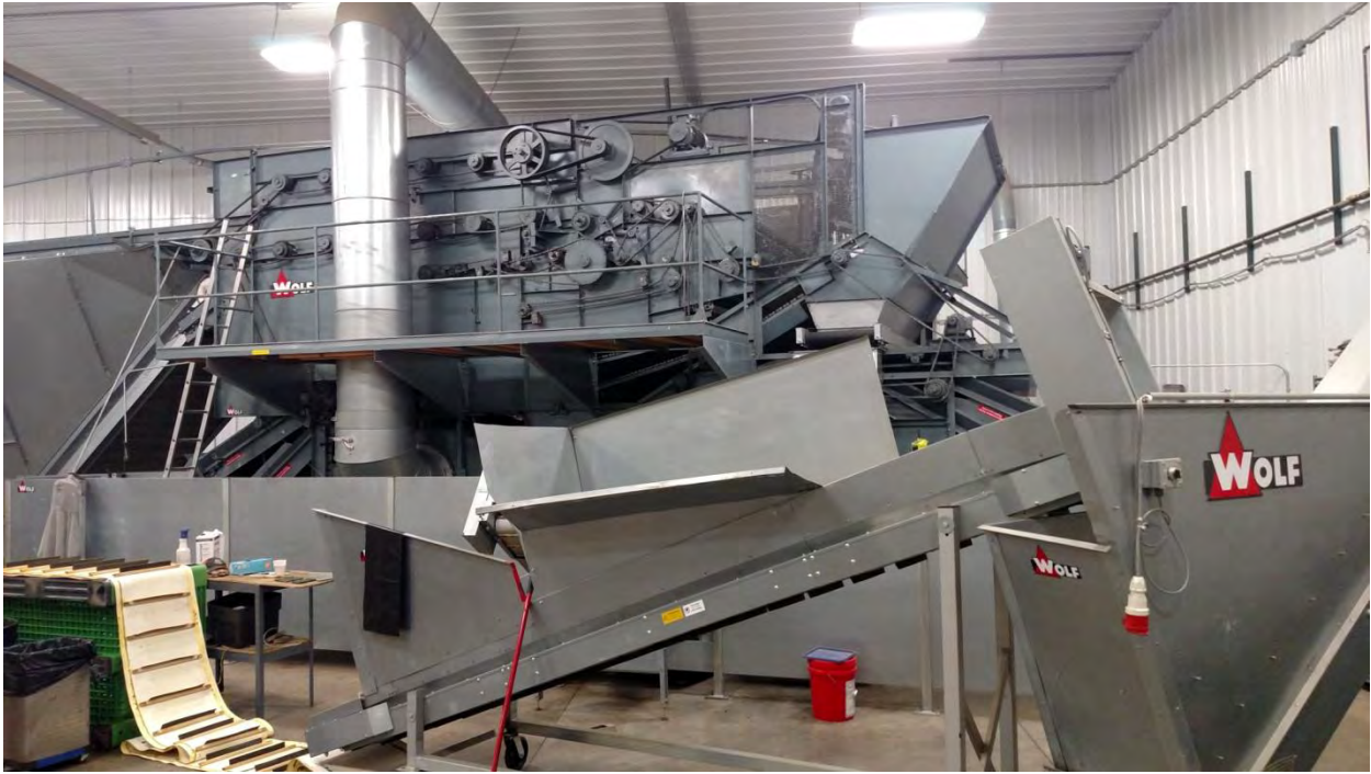
Wolf Harvester – Model 280