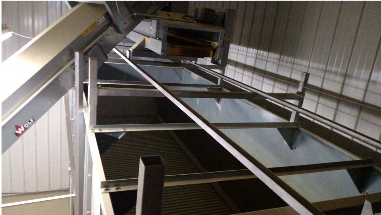
Oast Loading Bin