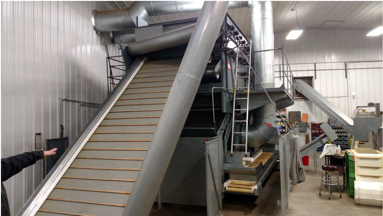
Hop Intake for Harvester