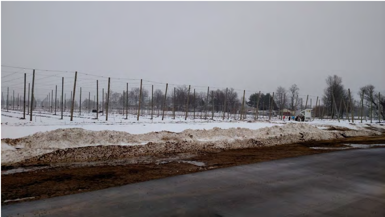
Hopyard Looking Northeast From Facility