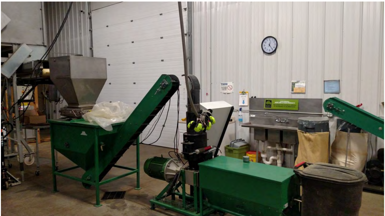
Pelletizer and Related Equipment