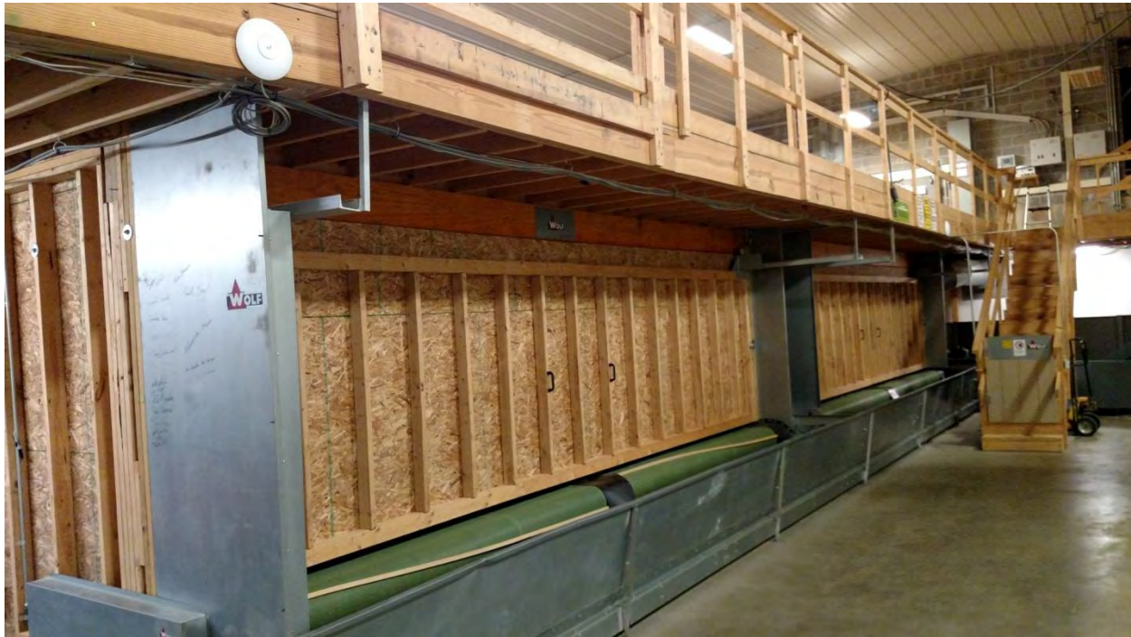
Hops Conditioning Bins