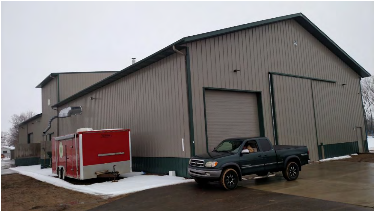
Processing Facility – north and east elevation