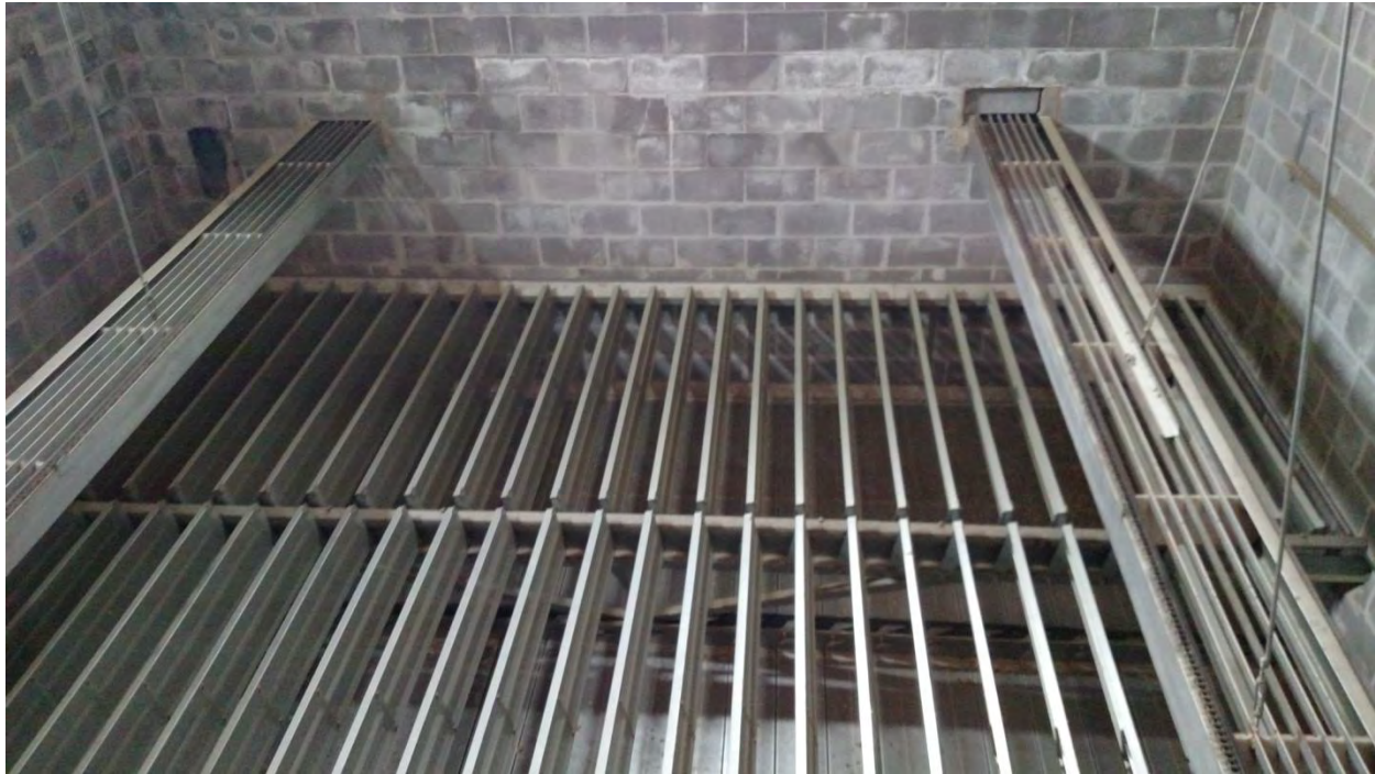
Oast Drying Floor