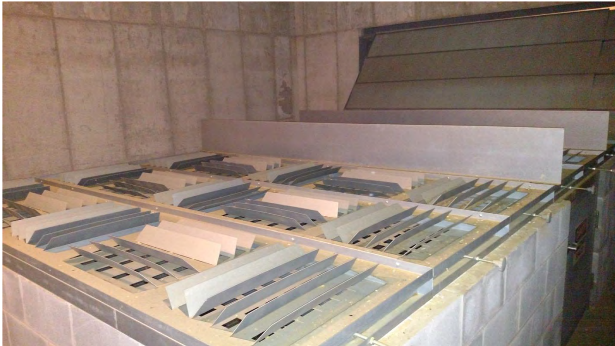
Oast Heat Diffuser