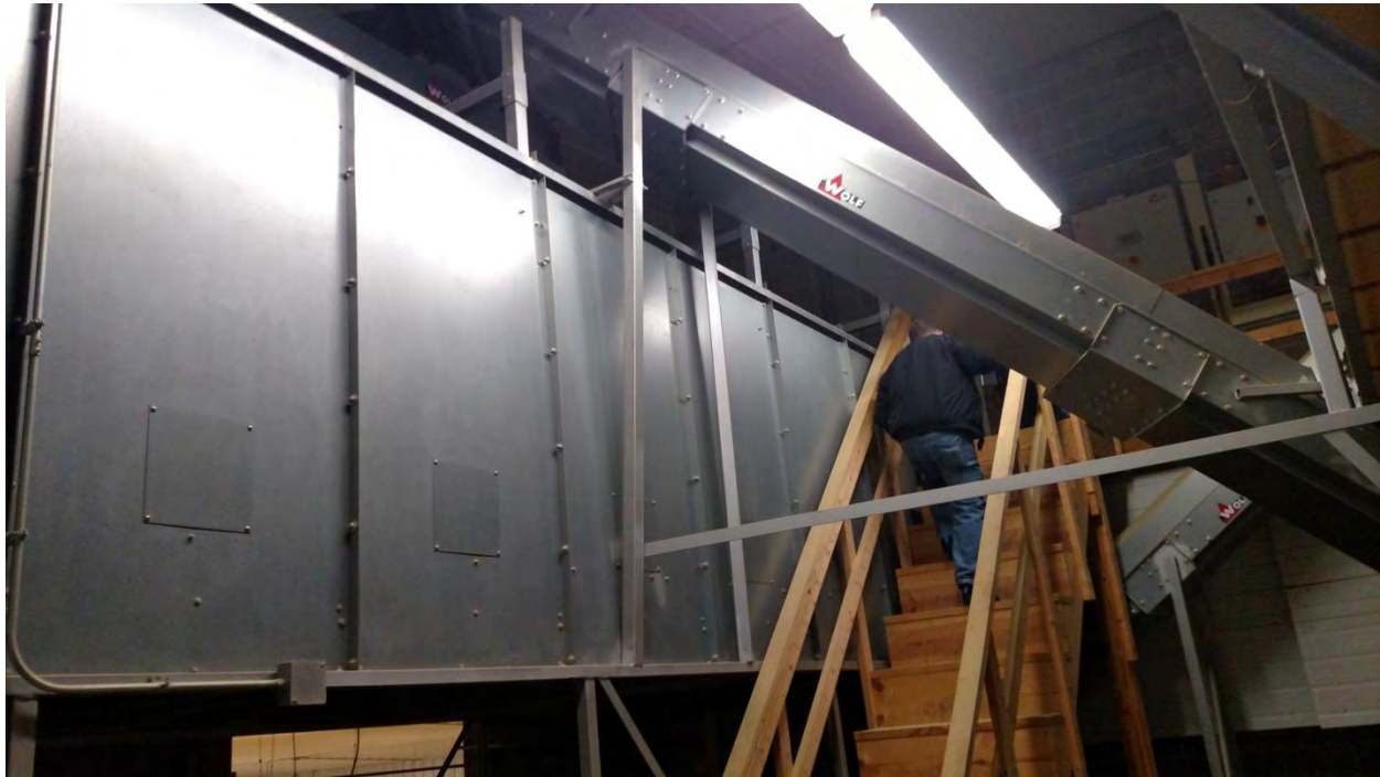
Oast Loading Bin