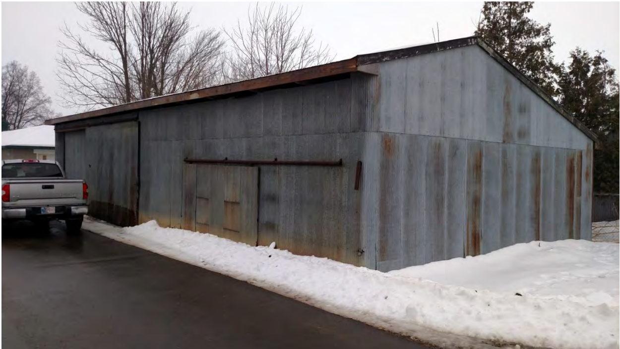
Old Storage Building