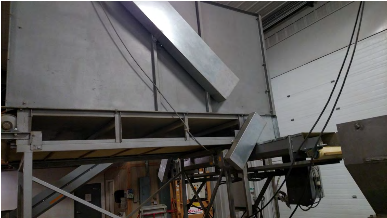
Hop Storage Bin Prior to Baler or Pelletizer