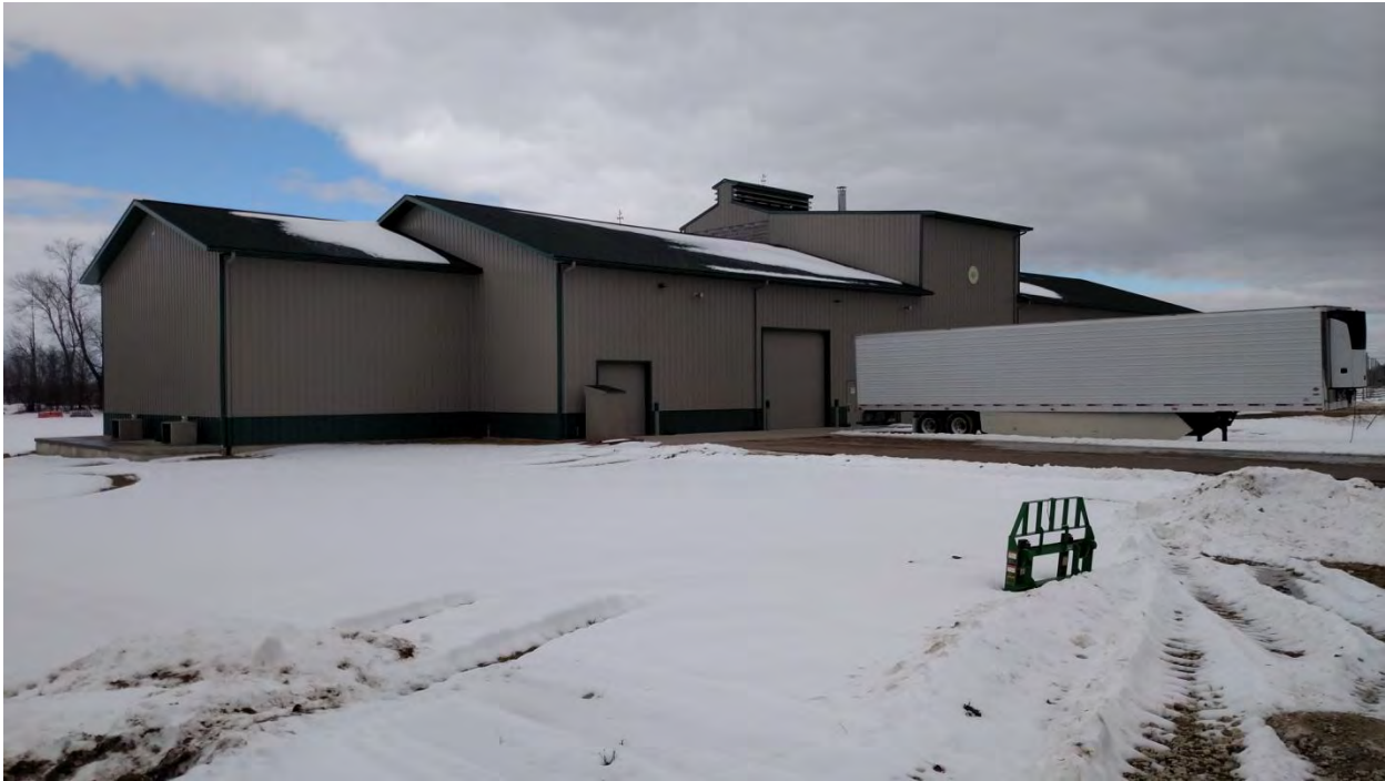
Processing Facility – south and east elevation