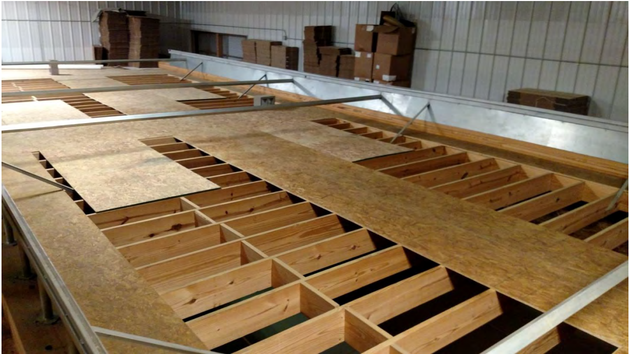
Top of Hop Conditioning Bins