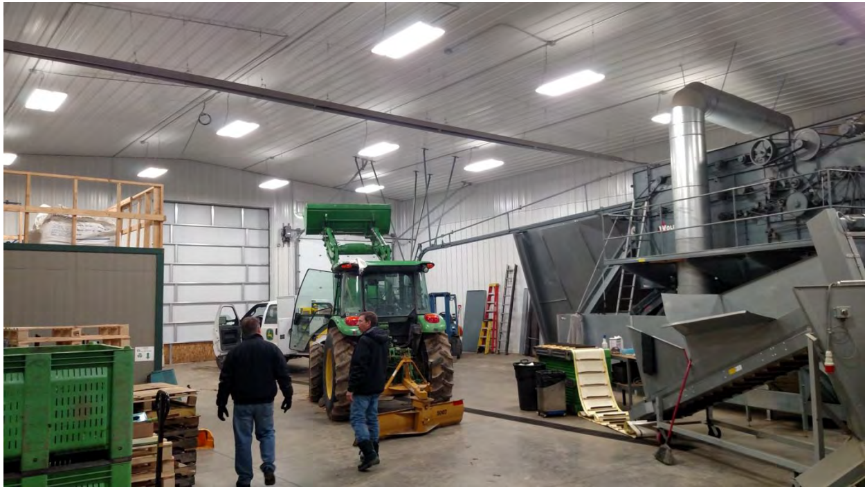
Picking Room/Shop Area