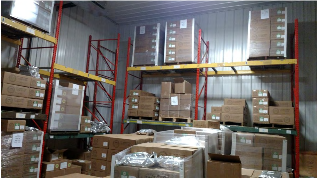
Interior – cooler storage